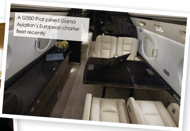
A G550 that joined Gamma Aviation's European charter fleet recently