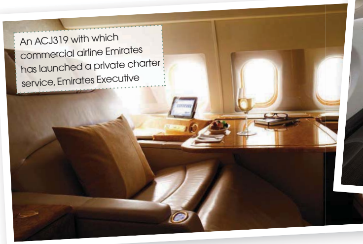
An ACJ319 with which commercial airline Emirates has launched a private charter service, Emirates Executive