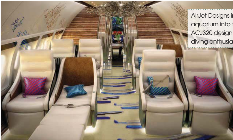
AirJet Designs incorporated an aquarium into this 'Acquario' ACJ320 design for a scuba diving enthusiast